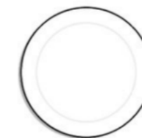
A plate is a circle.

Are you ready to go on a shape hunt? Hunt around your house or outside to find shapes!